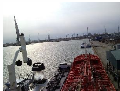
OMC-160 installed on tanker