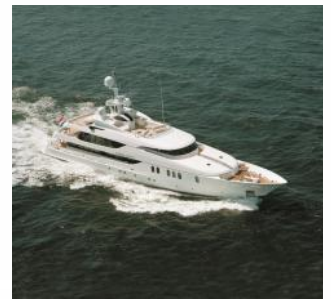
OMC-160 installed on mega yacht